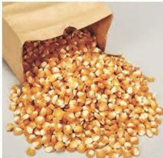
1.Corn- monocot seed

5. Identify whether monocot or dicot seed