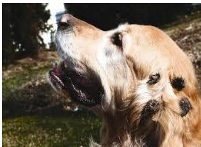
1. Thorny seeds

c. Animal dispersal -some seeds have hooks and spines which stick to the furry hair of animals like dogs ,squireels,.,some birds swallow the seeds and disperse the seeds.