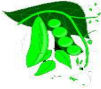
1. Pea pod