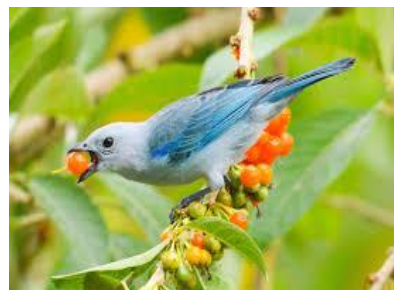
2. juicy fruit

d. Explosion of seeds : Some seeds explode or burst open when they dry and scatter the seeds.ex pea pod,balsam seeds