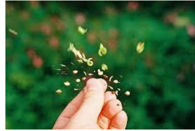
2. Balsam seeds

9. All new plants do not grow from seeds. They grow from other parts like roots, stem or leaf. If you were a gardener, which part of a plant would you plant to grow a new